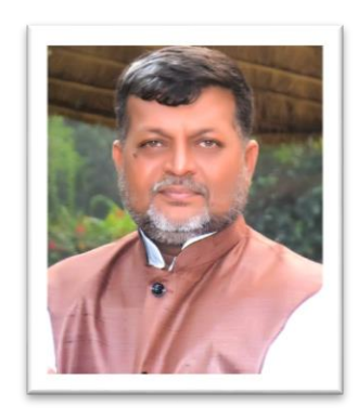
Jitendra Kumar Rai Hon'ble Minister Art, Culture & Youth Department Govt. Of Bihar