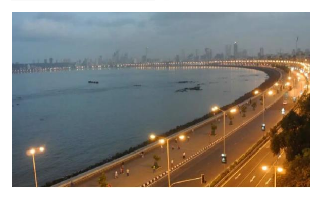
Patna Marin Drive: 10 KM from venue