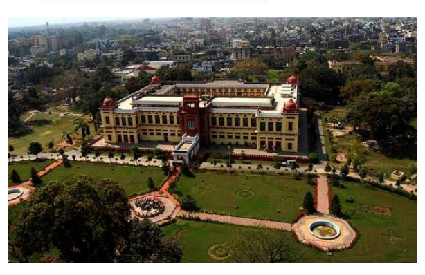
Patna Old Museum:,: 2 KM from venue