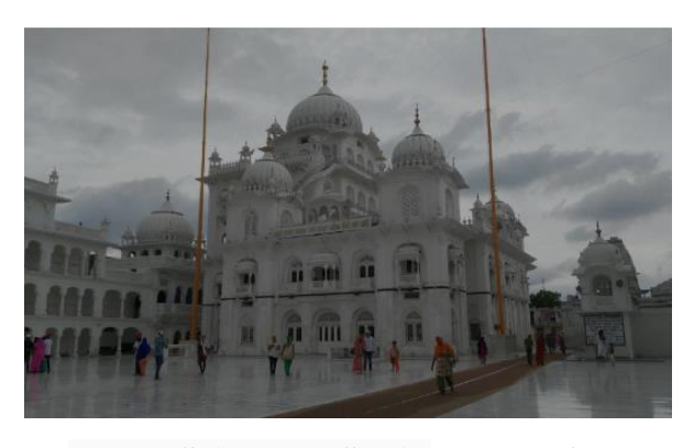
Takht Sri Patna Sahib: 16 KM from