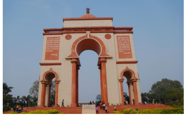
Sabhvata Dwar:200 m (backside) from venue