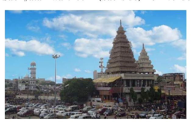
Mahavir Mandir: 2.5 KM from venue