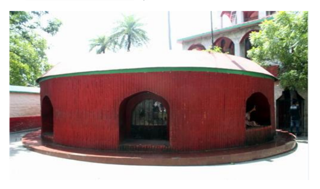
Agam Kuan: 7.4 KM from venue