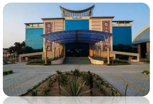
Welcome to Patna!!