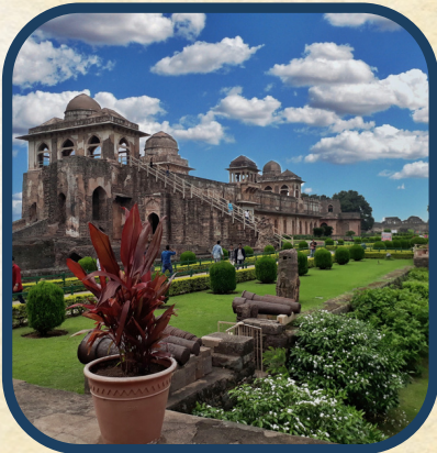
Mandu – Historical Tour