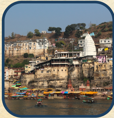
Maheshwar Ghats Take A Stroll