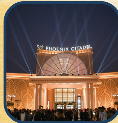
Phoenix Citadel Mall