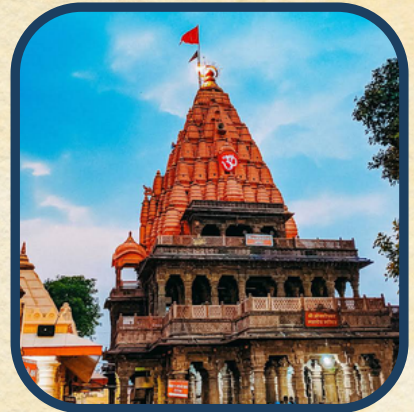
Mahakaleshwar Temple, Ujjain