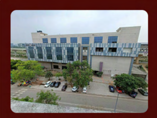
Nearby Metro Station (Noida Sector 137 & 83 Metro Station)