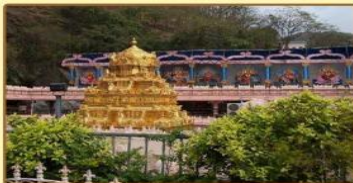
KANAKA DURGA TEMPLEV