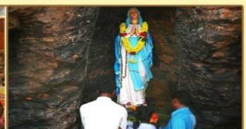
GUNADALA MATHA SHRINE