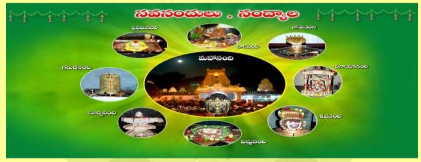
Tourist Places nearer to Nandyal District