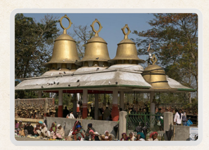
Bordubi Tilinga Mandir

All other participants ₹1,700/- (One thousand seven hundred only.