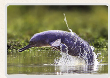
Dibru Saikhowa Dolphin Point