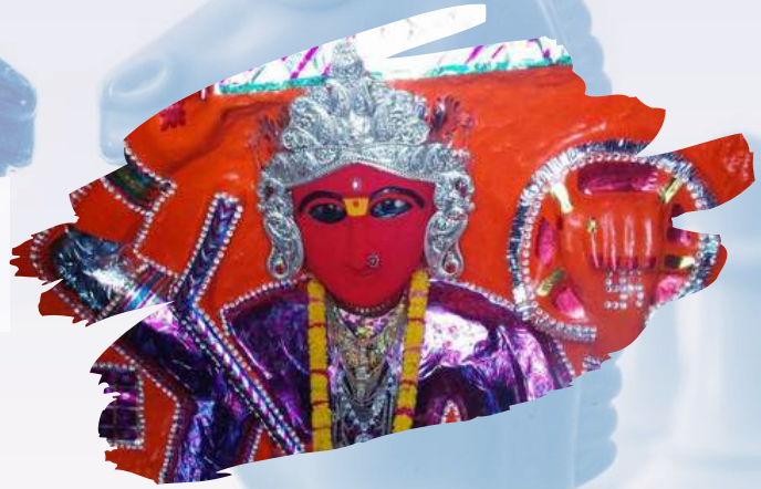
KHEONI WILDLIFE SANCTUARY