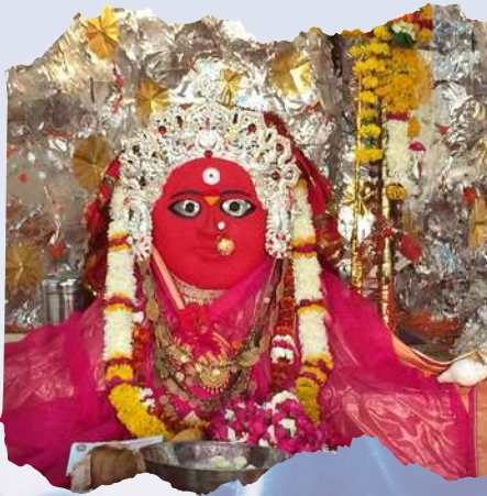
MAA CHAMUNDA MANDIR