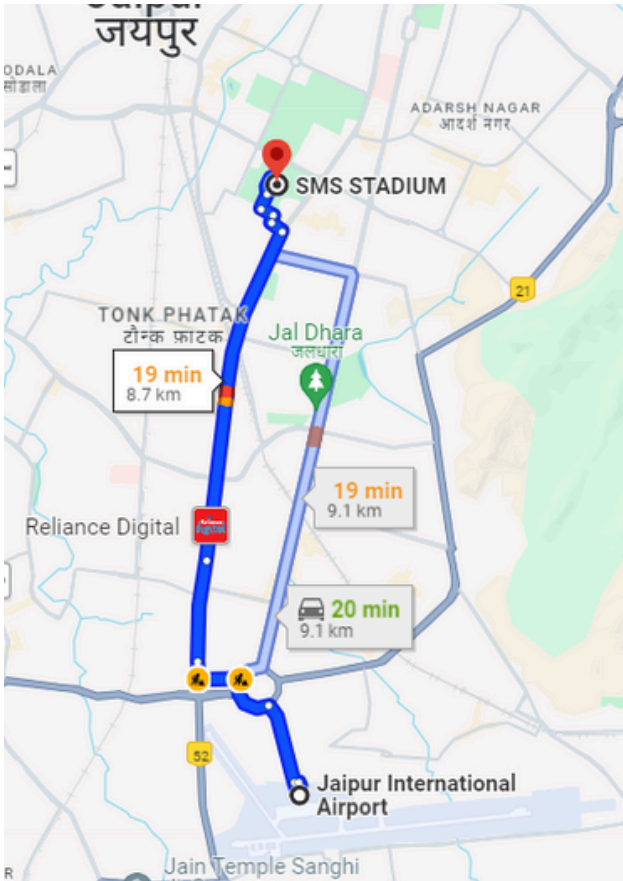
Form Jaipur Airport