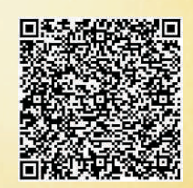
Scan for Location

Organized by: Panchajanya Chess Academy (R), Bengaluru