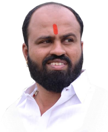
Hon. Bhausahab Rodage