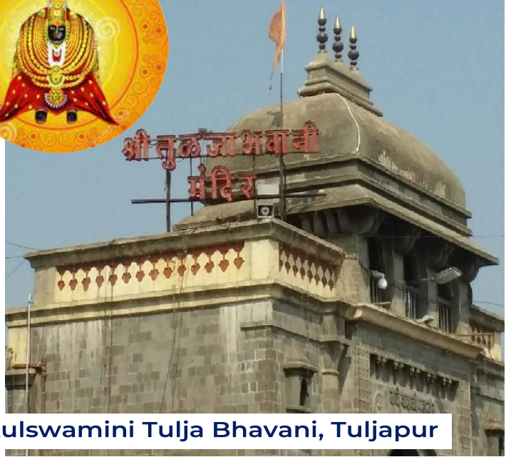
Kulswamini Tulja Bhavani, Tuljapur