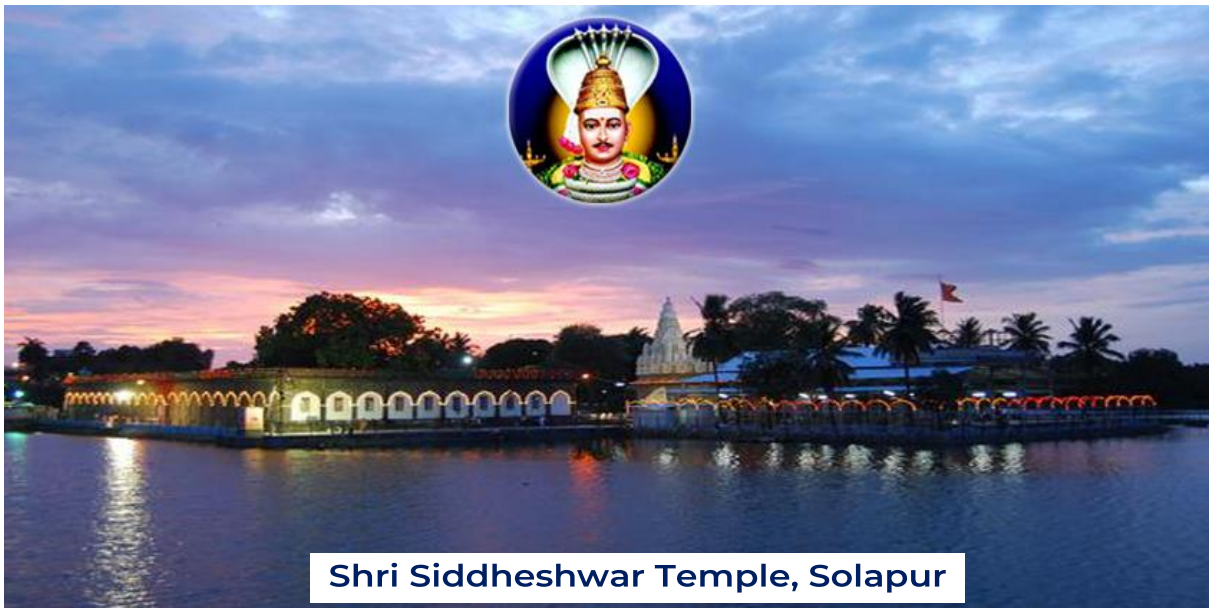
Shri Siddheshwar Temple, Solapur