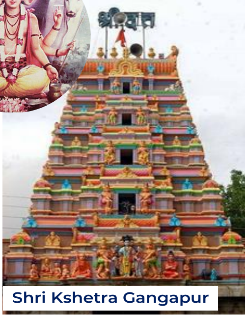
Shri Kshetra Gangapur