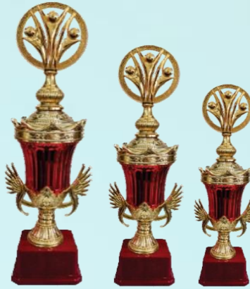
U-14, U-16 Boys