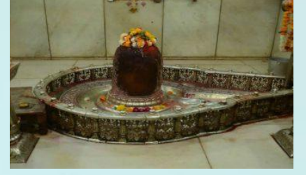
श्री महाकालेश्वर मंदिर