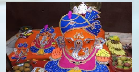
चिंतमन गणेश मंदिर