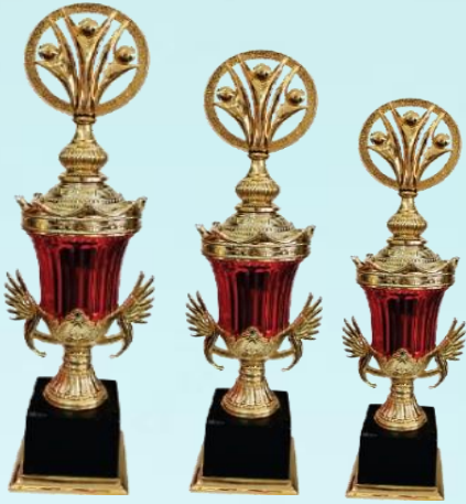
U 18 (Open)