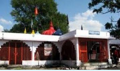
नवग्रह मंदिर (त्रिवेणी)