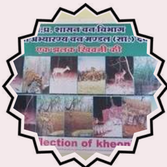
KHEONI WILDLIFE SANCTUARY