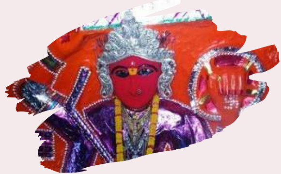
MAA CHAMUNDA MANDIR