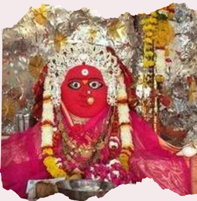
JAY MAA TULJA BHAVANI BADI MATA MANDIR