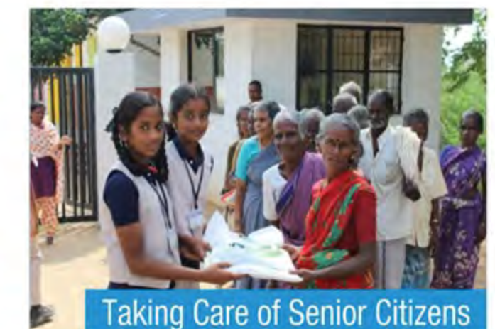
Taking Care of Senior Citizens