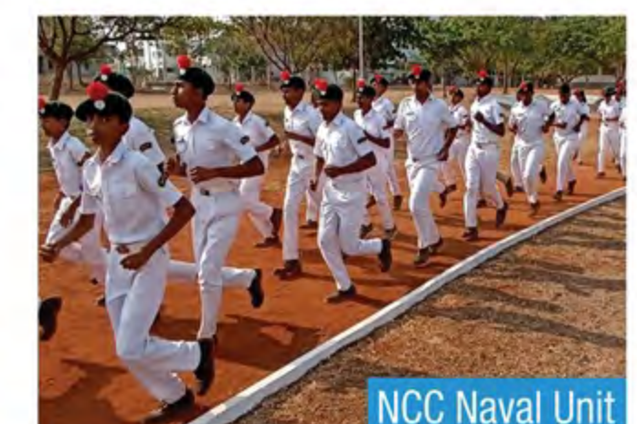
NCC Naval Unit