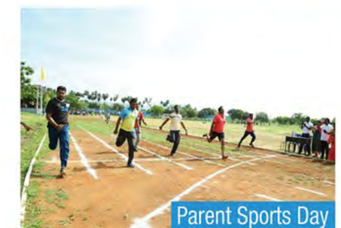
Parent Sports Day