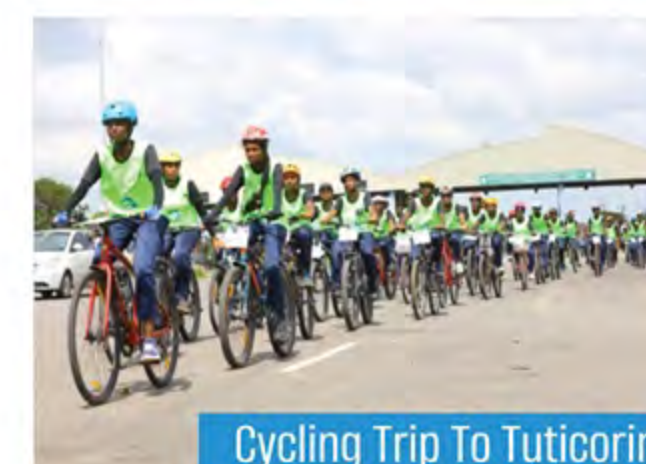
Cycling Trip To Tuticorin