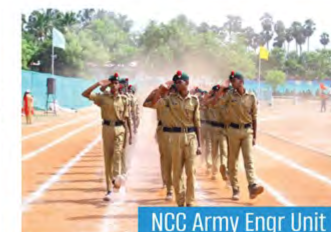
NCC Army Engr Unit