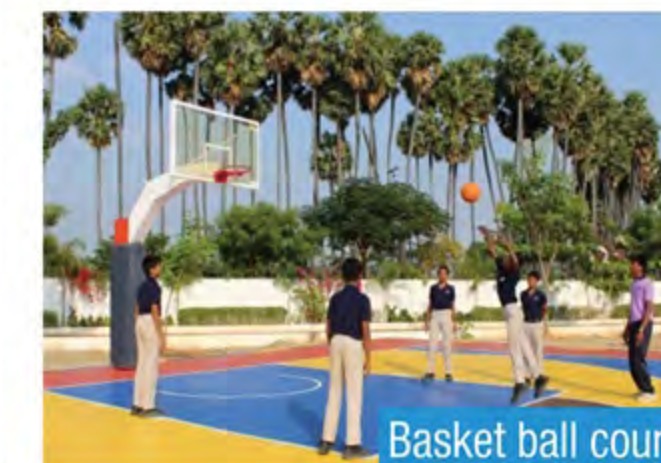
Basket ball court