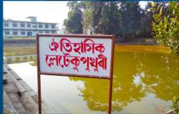
Leteku Pukhuri (Birth Place Of Mahapurush Madhavdev),