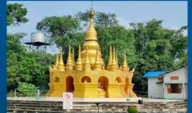
Golden Pagoda Borpathar