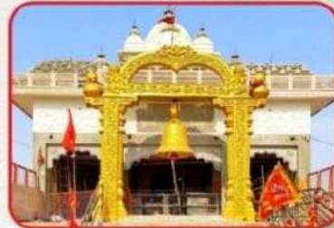
Maa Ratangarh Temple, Datia Distance of Venue : 50 KM