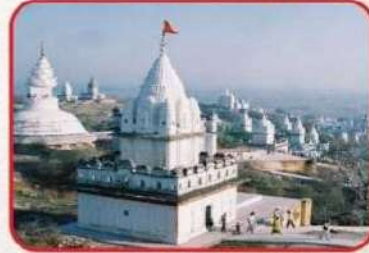
World Famous Jain Temple Sonagir Distance of Venue : 10 KM