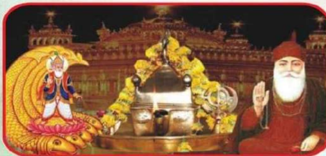
One and only Jyoti Temple in all over World Sant Hazari Ram Temple, Datia Distance of Venue : 1 KM