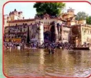
Sury Mandir Unao Balaji, Datia Distance of Venue : 15 KM