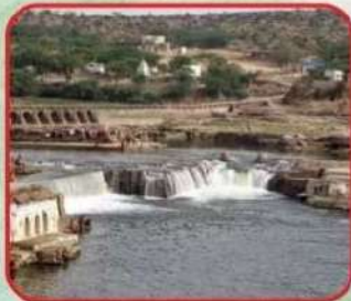
Sunkua Dham, Seondha, Datia Distance of Venue : 60 KM