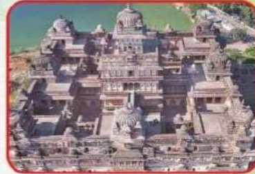
Veer Singh Palace, Datia Distance of Venue : 1 KM