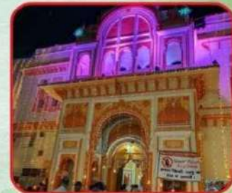
Ramraja Temple Orchha Dham, Datia Distance of Venue : 45 KM