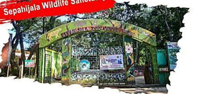
Sepahijala Wildlife Sanctuary