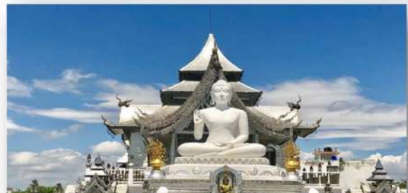
Metta Buddharam Temple