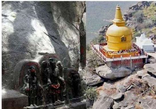
Pret Shila Mandir