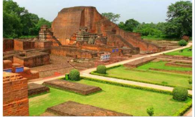
Nalanda University Ruins