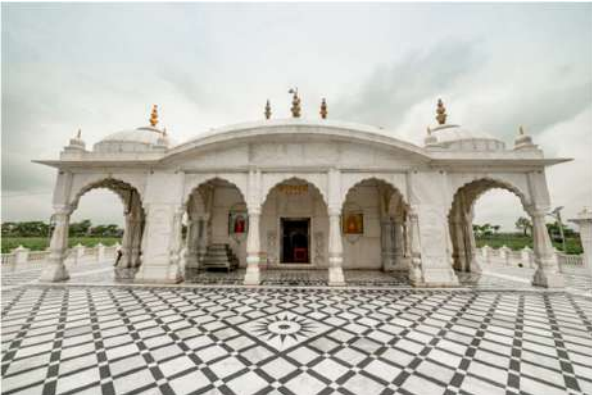
Jal Mandir - Pawapuri