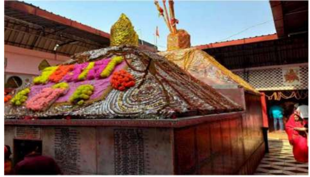
Maa Mangla Gauri Mandir