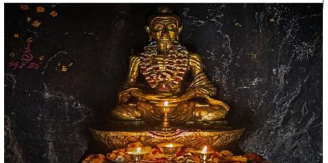
Dungeshwari Cave Temple