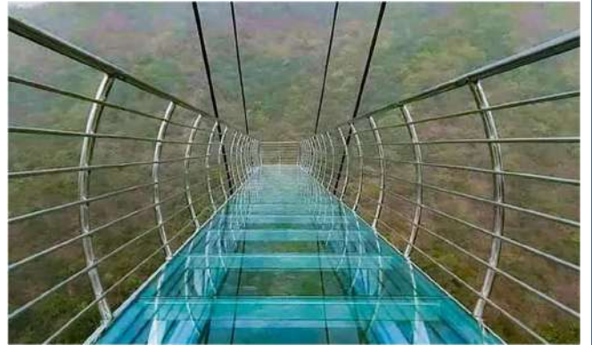
Sky Glass Bridge - Rajgir