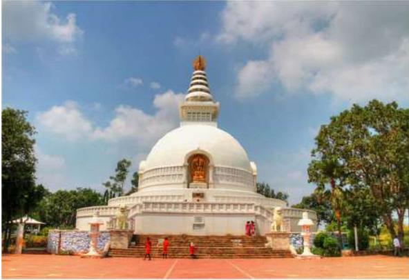
Vishwa Shanti Stup- Rajgir