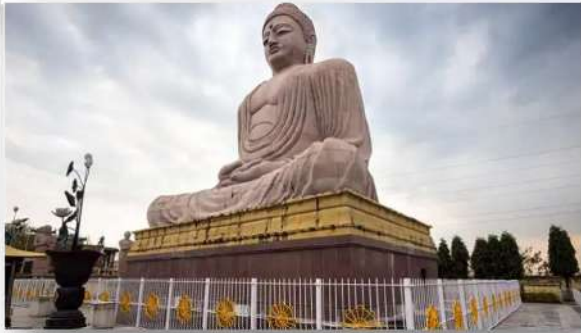
Great Buddha Statue