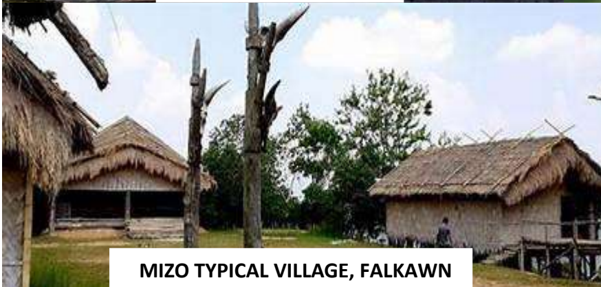
MIZO TYPICAL VILLAGE, FALKAWN