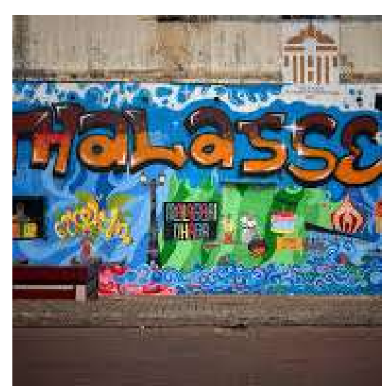
GRAFFITI ROAD THALASSERY