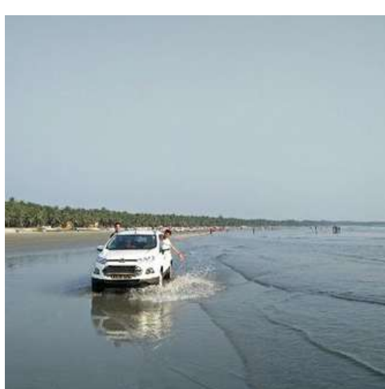
MUZHAPPILANGAD DRIVE IN BEACH