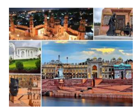
Chambal River Front