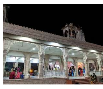
Godavari Dham Temple