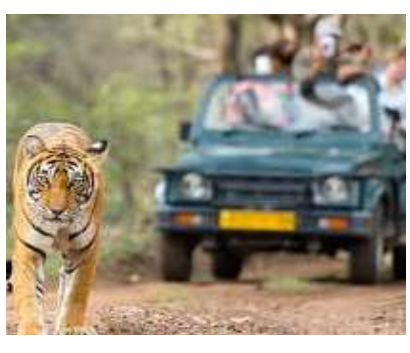
Mukundra Tiger Reserve