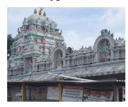
Garadia Mahadev Temple