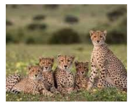
Darrah Wildlife Sanctuary