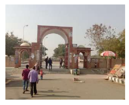
Khade Ganesh Ji