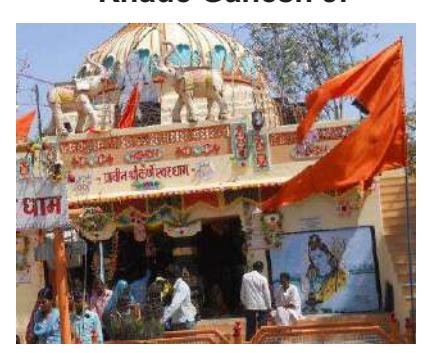
Karneshwar Mahadev Temple