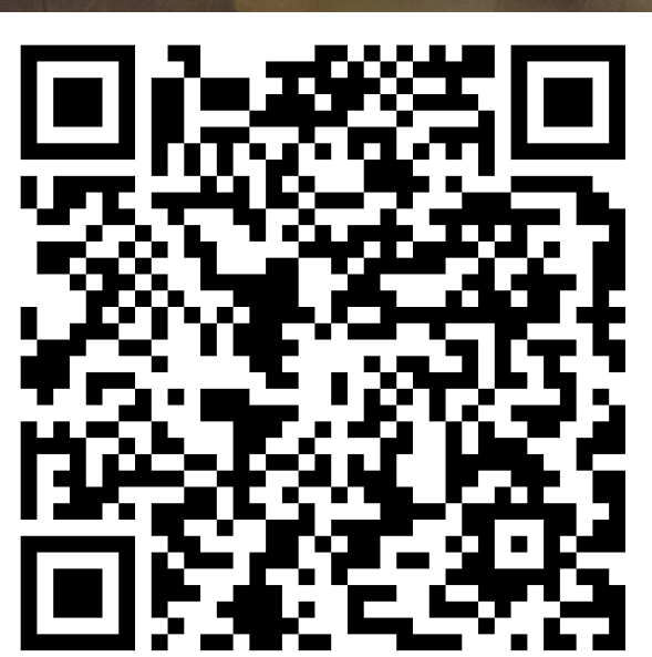
QR CODE FOR REGISTRATION