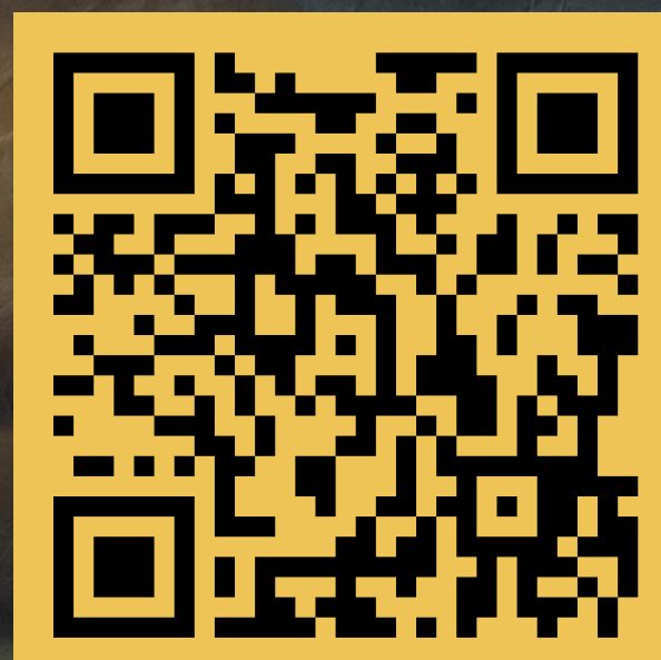
QR CODE FOR VENUE