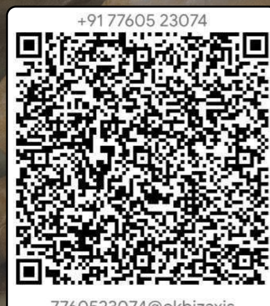
QR CODE FOR FEES TRANSFER