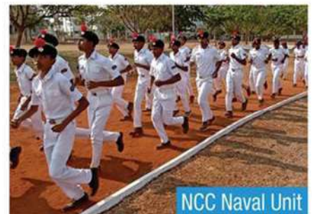
NCC Naval Unit