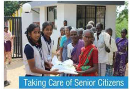
Taking Care of Senior Citizens