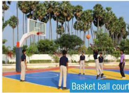
Basket ball court