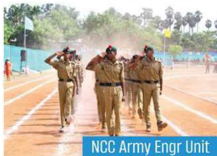
NCC Army Engr Unit