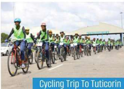
Cycling Trip To Tuticorin