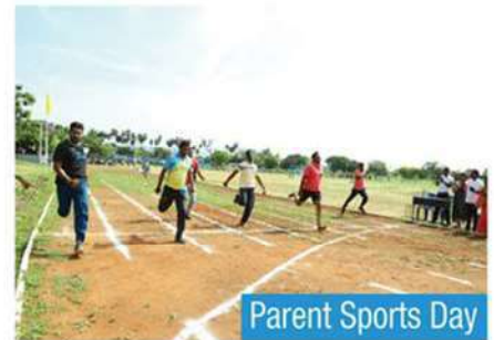
Parent Sports Day