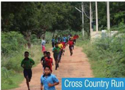
Cross Country Run