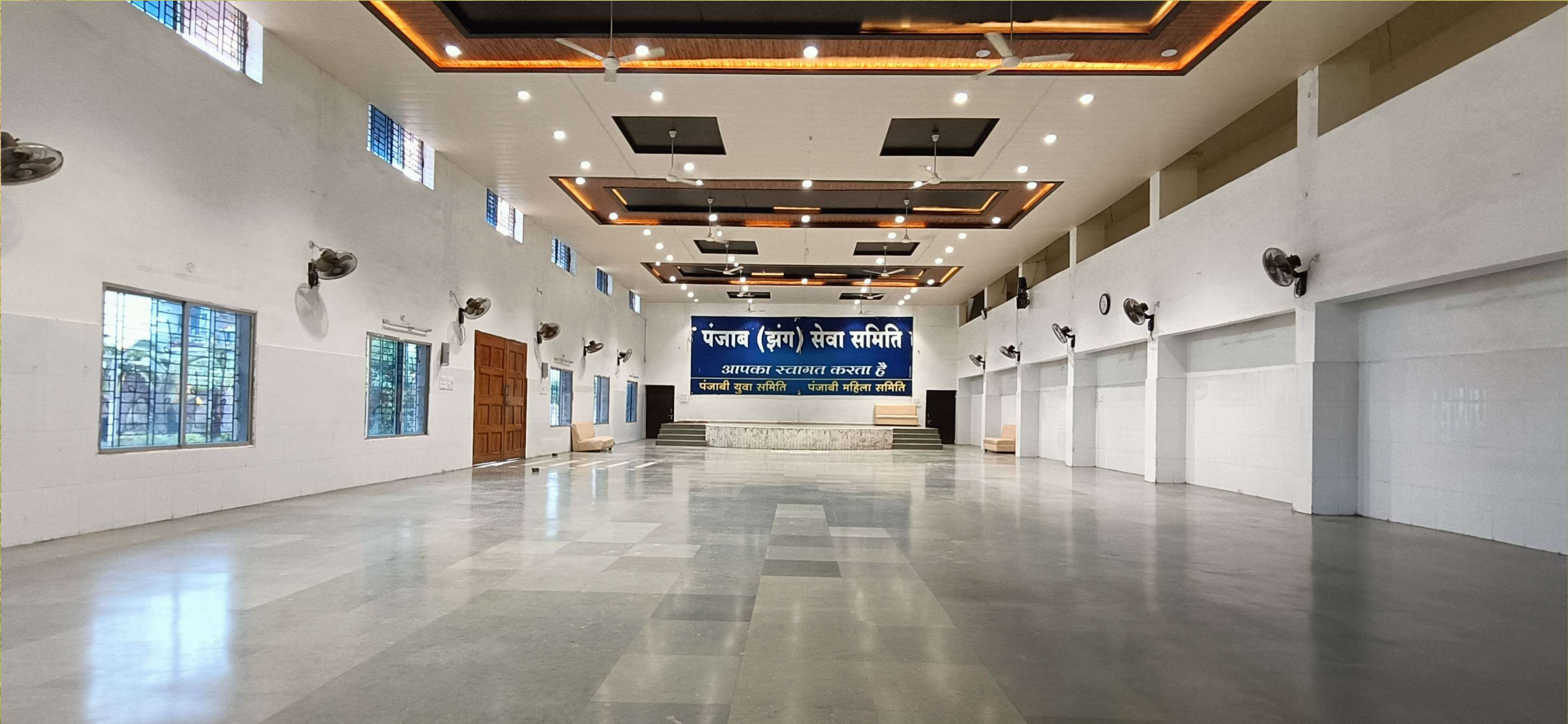
Playing Hall With Fully Air conditioning & Playground for Kids