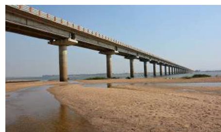
Kiakata Bridge-Over the Mahanadi