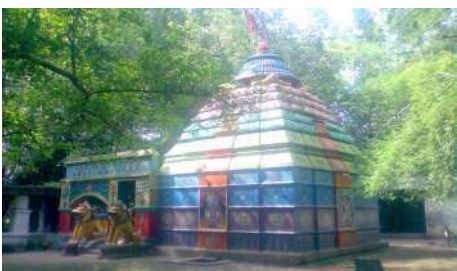
Bhairabi Temple, Purana Katak