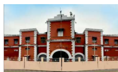
District Museum, Boudh