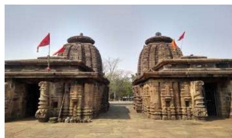
Chari Sambhu Temple