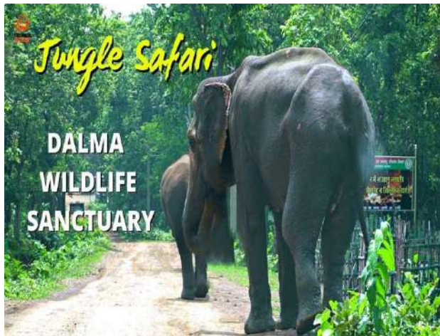
Dalma Wildlife Sanctuary