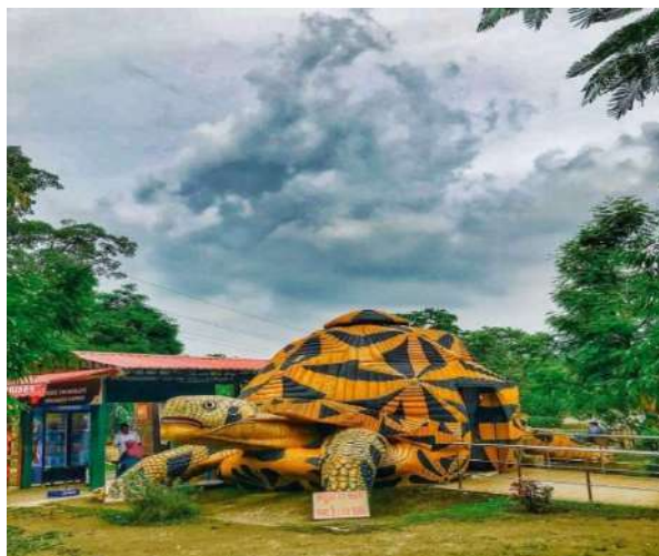
Tata Steel Zoological Park