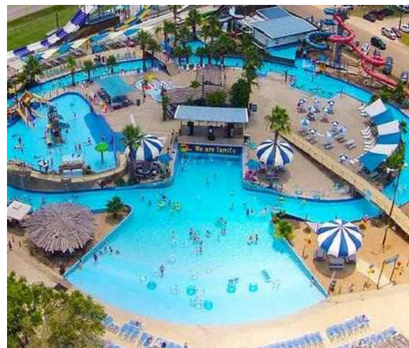
Birsa Fun City, Water Park