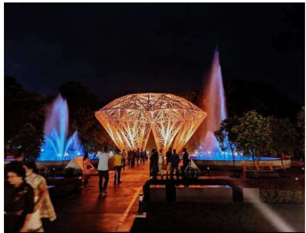
Sir Dorabji Tata Park