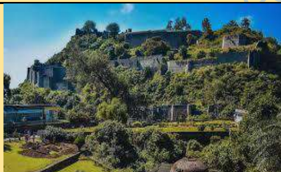
Kangra Fort, 5 Km

The Jayanti Mata Temple in Kangra is a Shakti Peeth dedicated to Goddess Durga, known for its significance in Hindu mythology and its historical connection to the Pandavas. Although often associated with Kangra, the main temple is located in Punjab's Jayanti Majri village, while the Kangra region has its own famous The Jayanti Mata Temple is believed to be a wish-fulfilling goddess and a kuldevi for the Pandavas