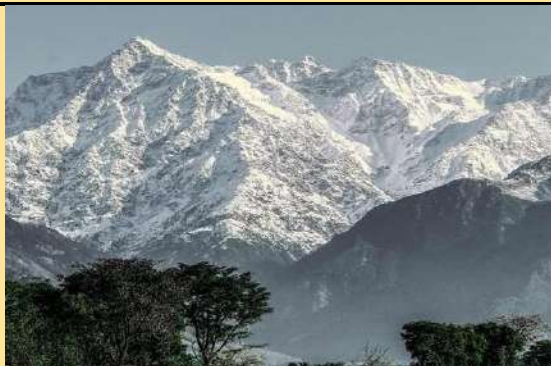
Dhauladhar Range, 20 Km

A Hindu temple dedicated to Shri Chamunda Devi , a form of Goddess Durga, located at 19 km away from Palampur town in Dharamshala Tehsil of Kangra district.