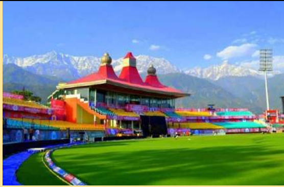
International Cricket Stadium ,17Km

Himachal Pradesh Cricket Association Stadium is an international cricket stadium in Dharamshala hill station of Himachal Pradesh, India.