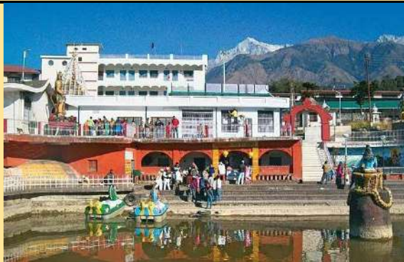
Shri Chamunda Devi ,25 Km

Himachal Pradesh Cricket Association Stadium is an international cricket stadium in Dharamshala hill station of Himachal Pradesh, India.