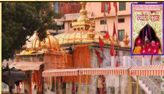
Jawala Ji, 35 Km

The Dhauladhar mountain range is located in the Indian state of Himachal Pradesh, in the Lesser Himalayas. It stretches across districts like Kangra and Chamba, forming a prominent backdrop for popular towns such as Dharamshala, McLeod Ganj, and Palampur.