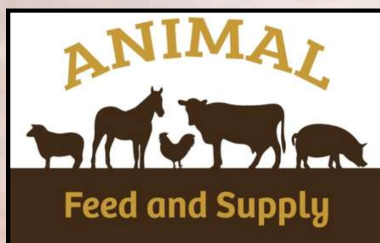
Naman Feed Store