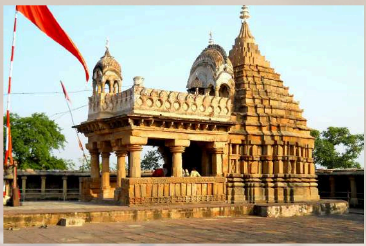
Chausath Yogini Temple