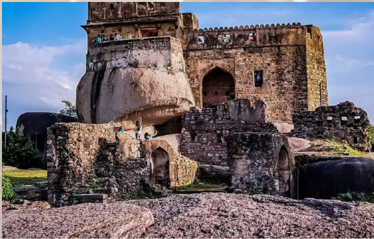
Madan Mehal fort