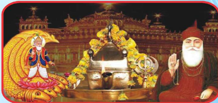
One and only Jyoti Temple in all over World Sant Hazari Ram Temple, Datia Distance of Venue : 0 KM