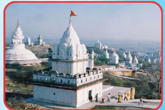
World Famous Jain Temple Sonagir Distance of Venue : 10 KM