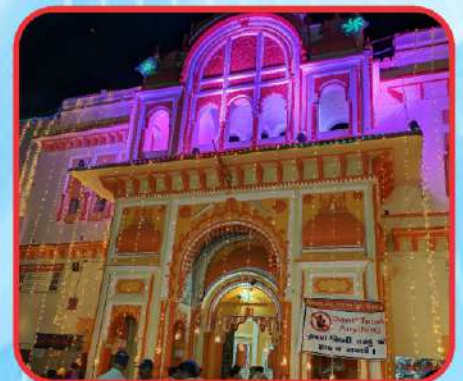
Ramraja Temple Orchha Dham, Datia Distance of Venue : 45 KM