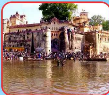
Sury Mandir Unao Balaji, Datia Distance of Venue : 15 KM