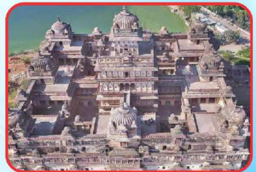
Veer Singh Palace, Datia Distance of Venue : 1 KM