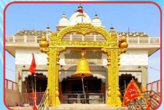
Maa Ratangarh Temple, Datia Distance of Venue : 50 KM