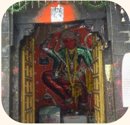
Jay Maa Tulja Bhavani Badi Mata Mandir Dewas