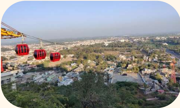
Maa Chamunda Ropeway