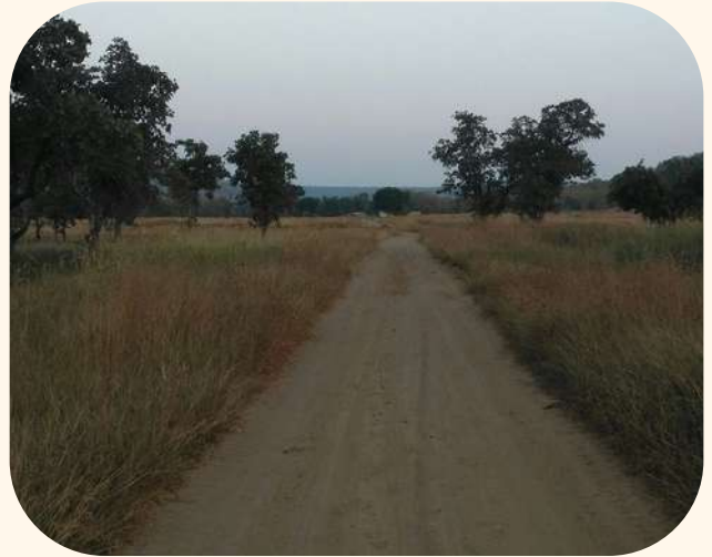
Kheoni Wildlife Sanctuary