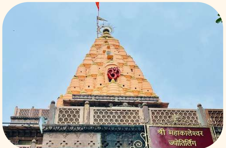
Mahakaleshwar Temple Ujjain