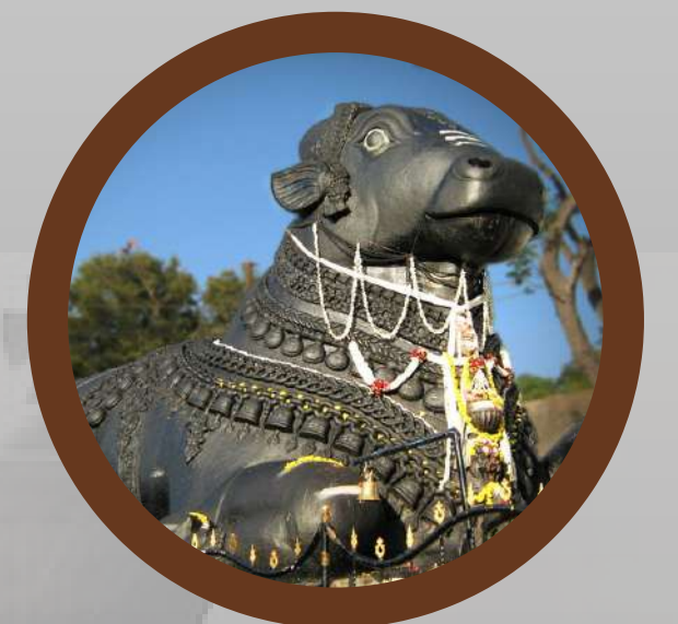
Nandi temple, Mysore