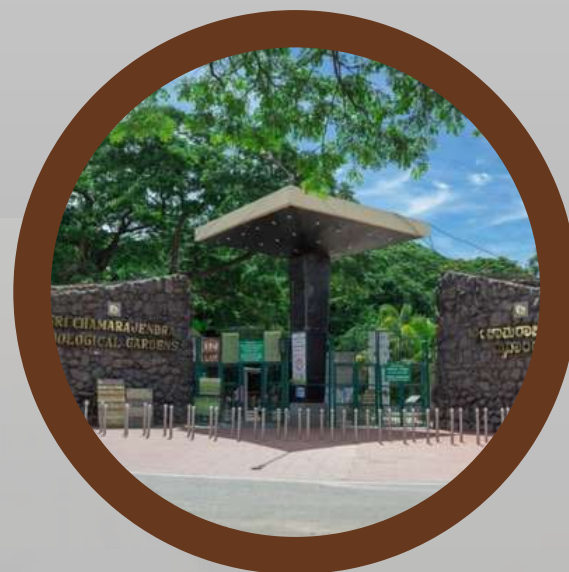
Sri Chamarajendra Zoological Gardens