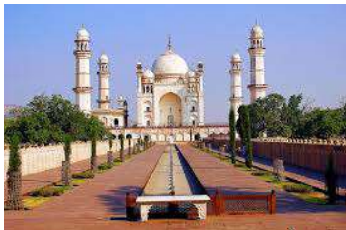
Bibi ka Makbara