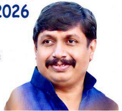
(President - Solapur District Chess Association) Hon. MP. Dhairyasheel Mohite - Patil

Champ Chess School & Next Move Online Chess Academy