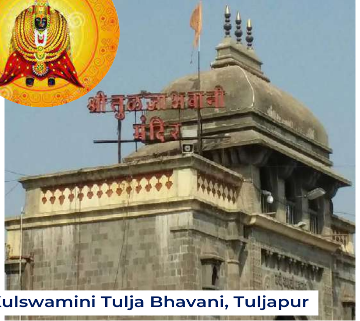
Kulswamini Tulja Bhavani, Tuljapur