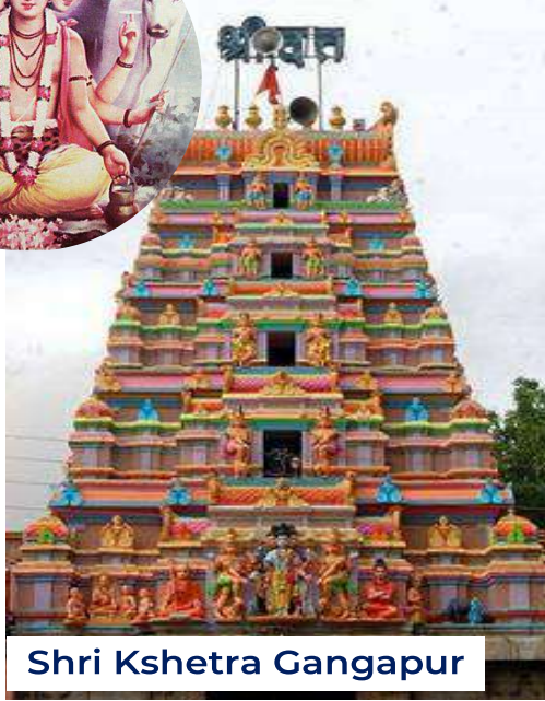
Shri Kshetra Gangapur