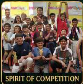
SPIRIT OF COMPETITION