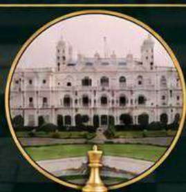
JAI VILAS PALACE