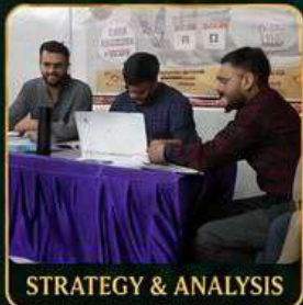
STRATEGY & ANALYSIS