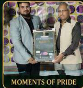
MOMENTS OF PRIDE