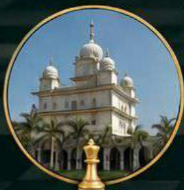
GURUDWARA DATA BANDI FORT