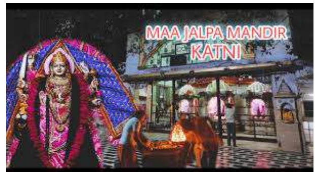
MAA JALPA DEVI MANDIR