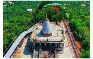
MAA SHARDA TEMPLE- MAIHAR