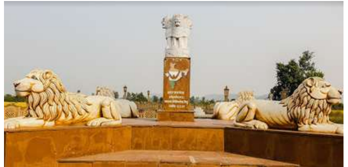
CENTRE POINT OF INDIA KARAUNDI